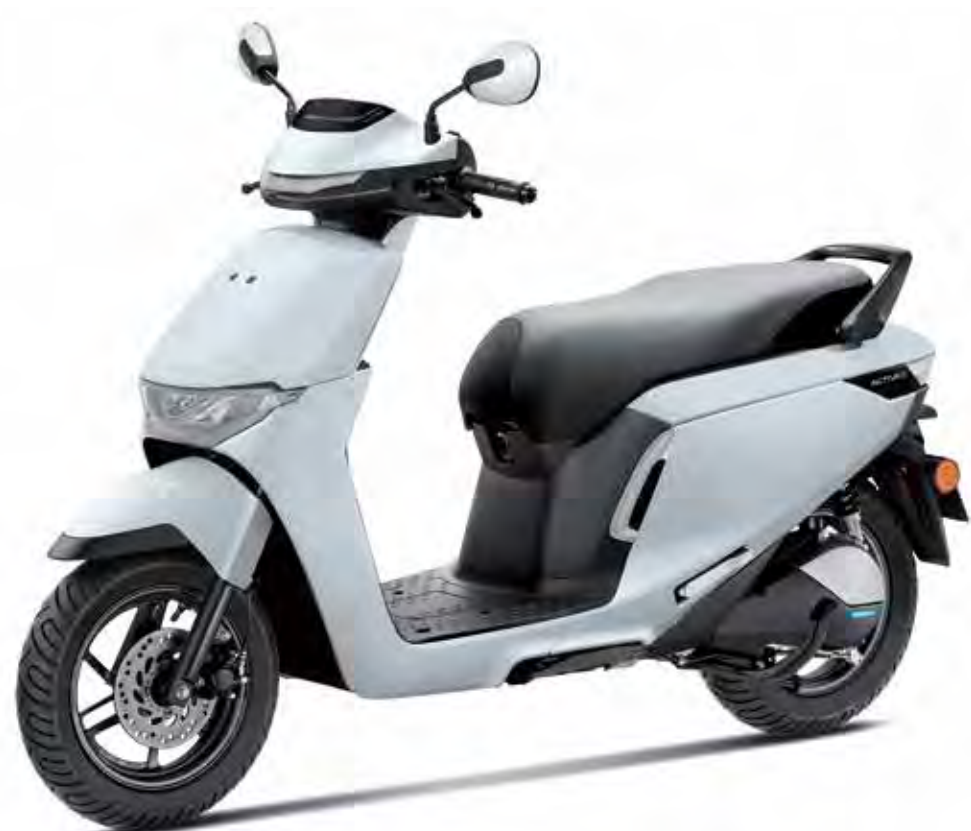
Pearl Misty White

*Products shown in the pictures may vary from actual products available in the market. All features and colours may not be part of all variants. Accessories shown in the pictures are not part of standard equipment. For creative visualisation only.